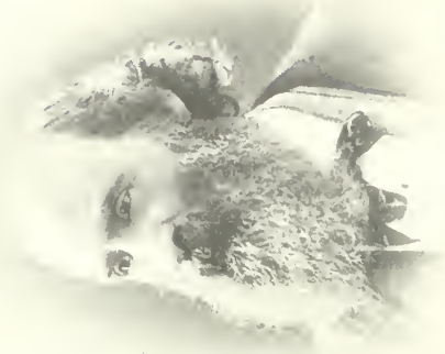
HENRY KIRK BROWN (692)