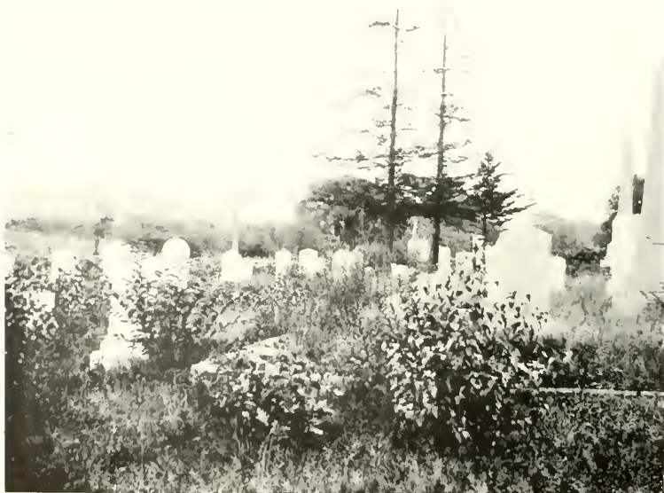
BROWN CEMETERY In front of Peckham Church