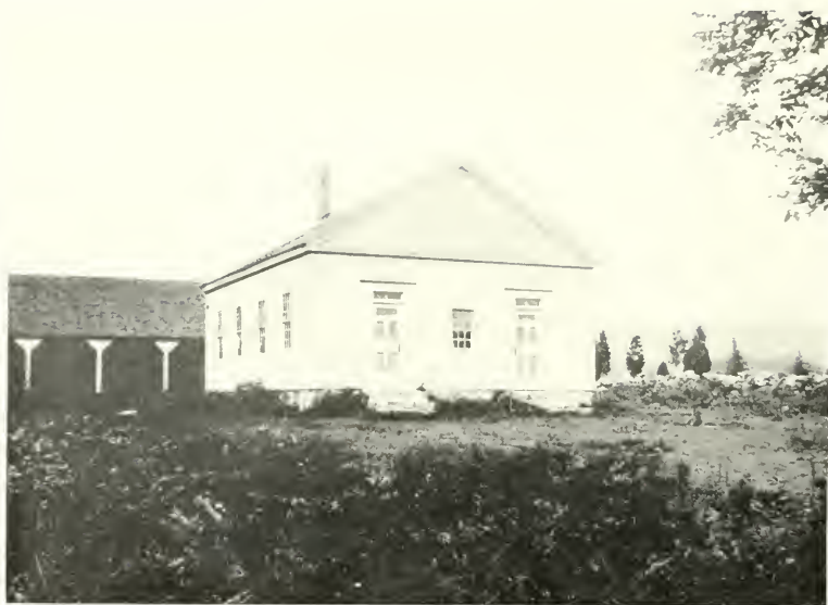
THE PECKHAM CHURCH Ledyard, Conn.